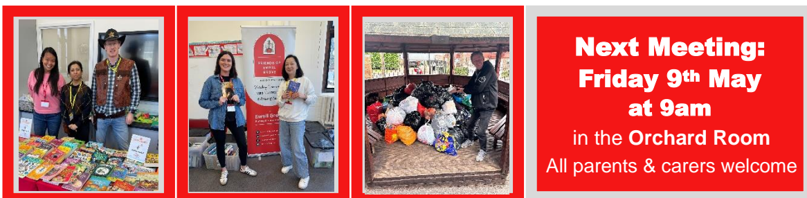
From L-R: some of our book swap volunteers; and our donated clothes pile for The Little Recyclers.

Due to popular request, our next open meeting will be during the day, from 9-10am on Friday 9 th May. All parents and carers are invited to attend to find out more about us, how we use the money raised for the school, and our plans for the Summer Fair!