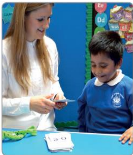
Learning the Speed Sounds in the classroom.